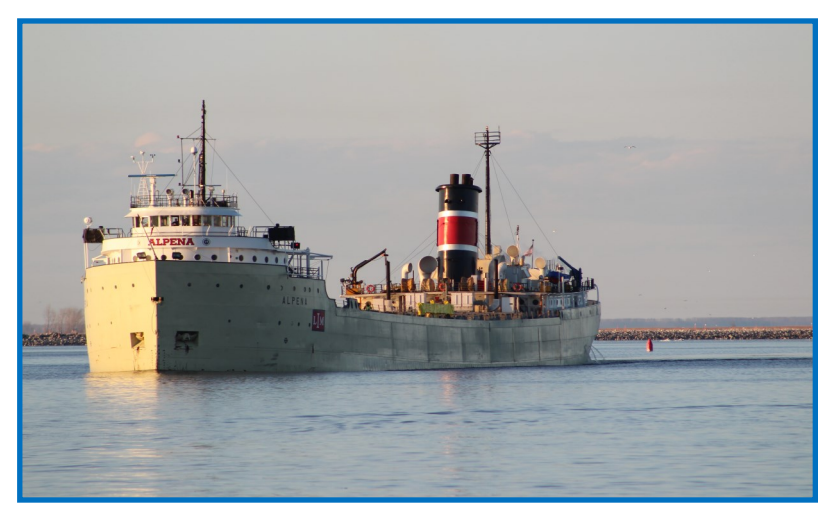
SS Alpena.