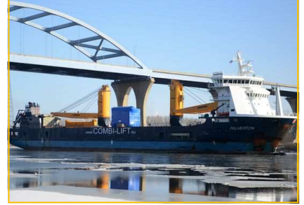
The Palmerton in the Port of Green Bay, WI in 2014.