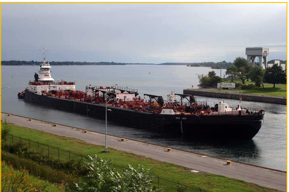
Michigan Great Lakes

Over all, the 2015 shipping season is projected to be as successful as that of 2014. When 2.3 million metric tons of cargo were transported. With the first ships arriving almost three weeks earlier than in 2014, along with Lake Michigan's higher water levels (read on to the next article) ships will be able to transport more cargo in and out of Green Bay this year.