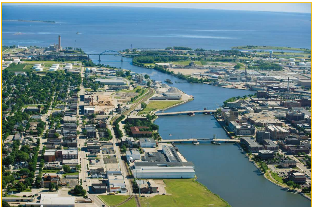
Port of Green Bay

This year as the Fox River Clean-Up Project makes its way through the Port towards downtown, water traffic will become more congested than normal. Since both recreational boaters and commercial ships use the river, they will have to take extra caution when maneuvering through the Port. However, the dredging project will have to accommodate for the right of way of commercial ships. The Brown County Port & Resource Recovery Department says that the clean-up process will not affect the 14 port businesses along the Fox River. This project is expected to be finished in 2017.