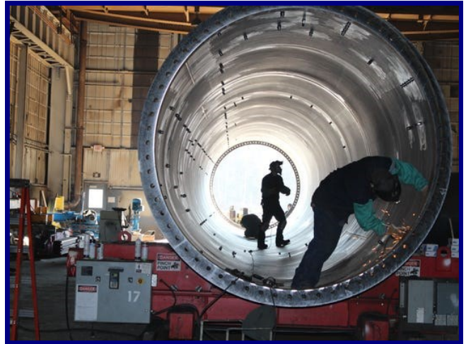
Inside the Broadwind Towers manufacturing plant

Several networking events have been arranged for attendees as well. One of these events include a tour of both the SS Badger at Manitowoc Dock and the Broadwind Towers facility. The SS Badger is a passenger and vehicle ferry that has been