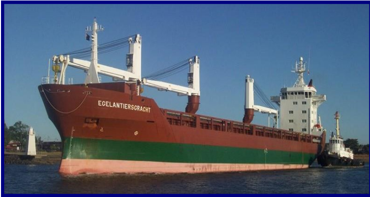
Egelantiersgracht carrying Wood Pulp from Sweden to KK Integrated Logistics terminal, early June

Since the beginning of the 2019 shipping season, there has been an increase in diversity of marine traffic to the Port of Green Bay. The Port regularly sees ships importing commodities from Michigan, Ohio, Chicago, Canada and other parts of Wisconsin; however, last month shipments of Wood Pulp from Santos, Brazil and Sweden made their way in to the Port.