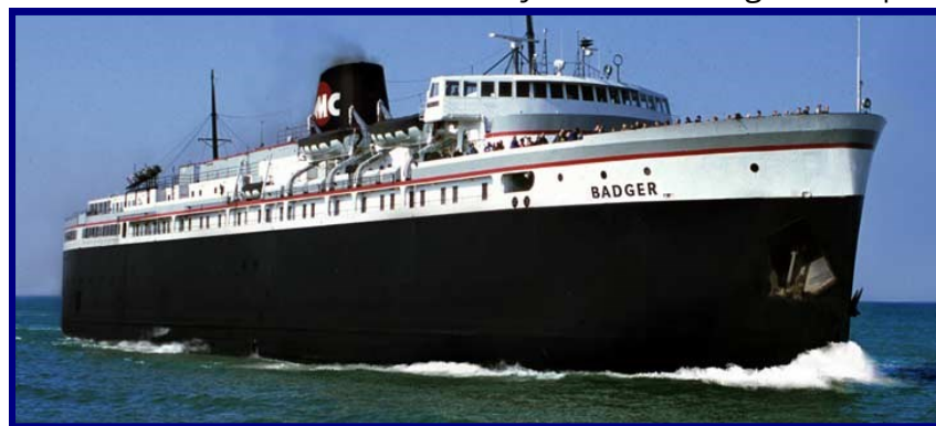
SS Badger

in service on Lake Michigan since 1953. Currently, the ship shuttles between Ludington, Michigan, and Manitowoc, Wisconsin. Broadwind Towers is home to the state's only wind tower manufacturer.