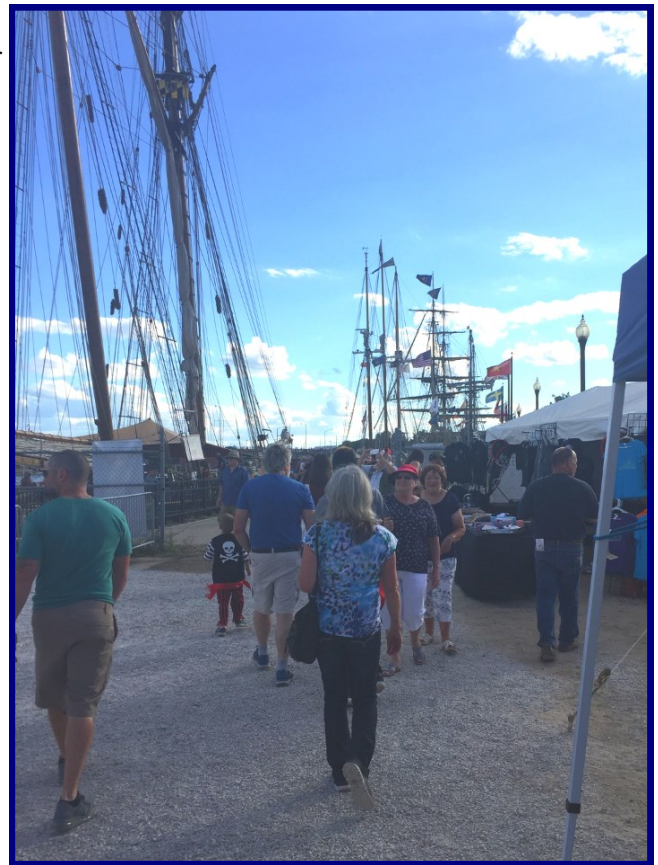
2016 Tallships festival-goers visit booths while admiring the tallships

Have a question about the Port? Port of Green Bay staff members will be visiting festival-goers on the boardwalk and will answer any port-related questions they may have (look for the neon yellow shirts!). They will also be putting temporary tattoos on kids and adults. Back at the Port's booth, staff will be teaching children how to make origami boats that can float. There will also be drone footage of the Port, giveaways and a model ship of the H. Lee White , a ship that frequents the Port of Green Bay.