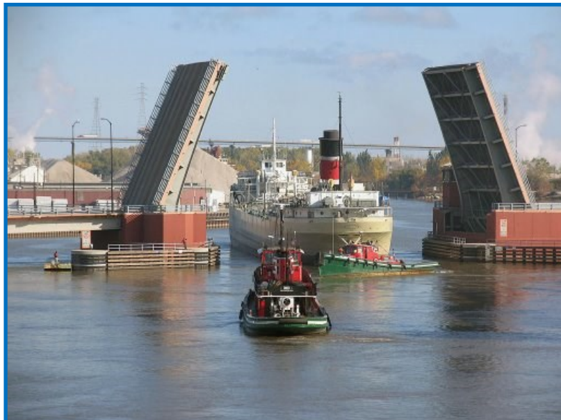
The Alpena sails down the Fox River.