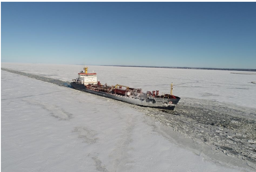
The AlgoCanada (2019)

“With the 2021 shipping season wrapped up, we’ll work on plans for the next shipping season as our terminal operators focus on repairs and maintenance of their dock facilities,” Haen added. The 2022 shipping season is expected to begin in mid-March to early-April, depending on the weather and ice cover on the lakes and bay.