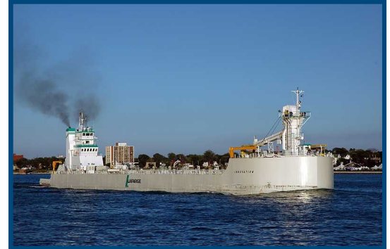
Innovation was the first ship of the 2016 shipping season. It carried cement to Lafarge on March 21.

We are excited to see your guess! Don't forget to watch for the link on www.portofgreenbay.com and www.greenbay.com . Good luck!