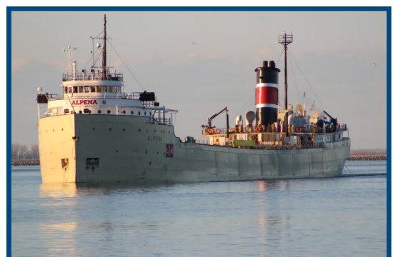
S.S. Alpena was the first ship of the 2013 shipping season. It carried cement to Lafarge on April 3.