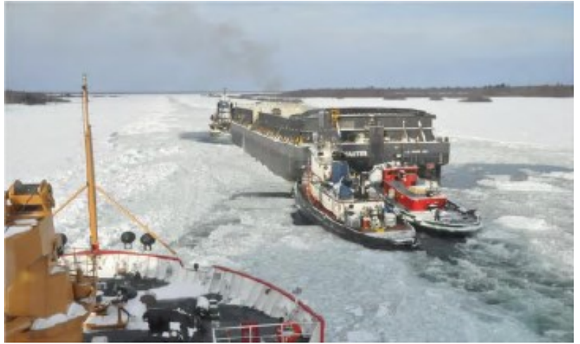
Ice Breaking on Lake Michigan in 2016/2017 Shipping Season

The U.S. Coast Guard established and maintained tracks through the ice from Rock Island Passage to the Fox River. The tracks through the ice extended to Escanaba, Marinette-Menominee, Sturgeon Bay and Green Bay.