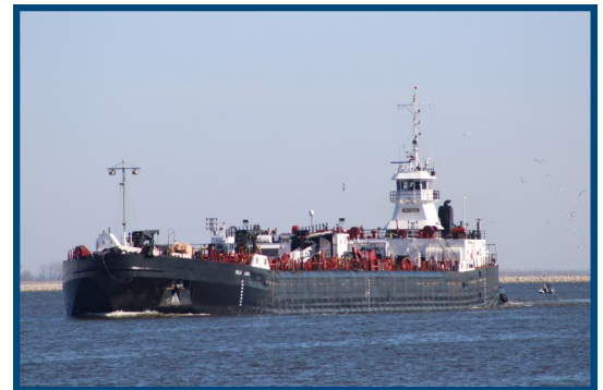
Michigan Great Lakes was the first ship of the 2014 & 2015 shipping season. It carried petroleum to U.S. Oil on April 18 and April 3, respectively.