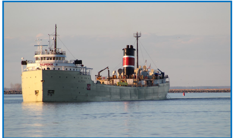
SS Alpena.