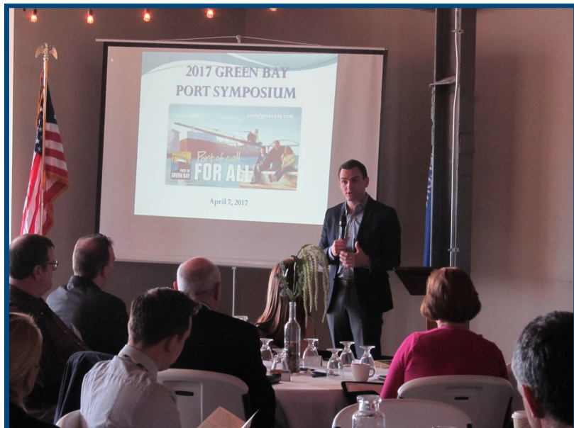
Congressman Gallagher speaking at the 2017 Port Symposium

This year marked the 19th Annual Port Symposium. This year's attendance of 115 people was the highest the Port has seen at the event.