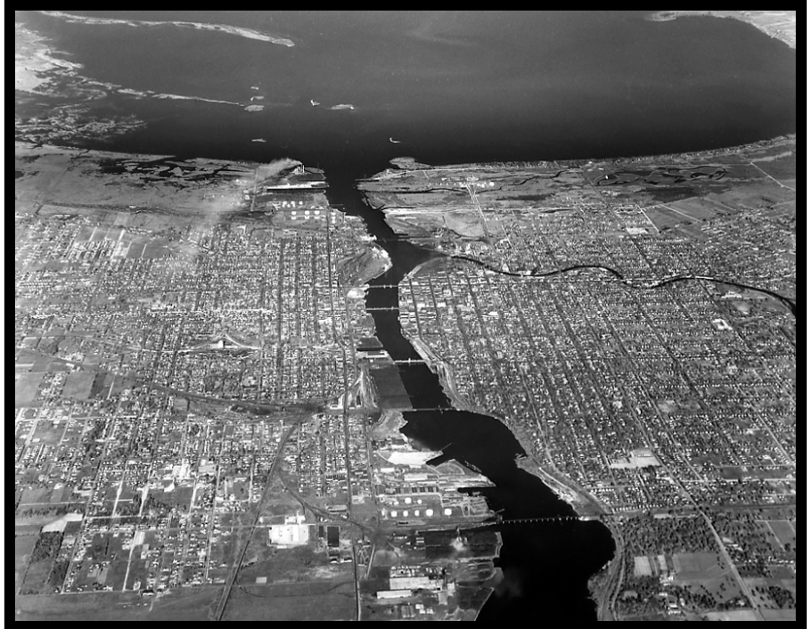
The upper left of the photograph shows the Duck Creek Delta and Cat Island Chain reaching almost the navigational channel. This project will restore these features.

In addition, a complete restoration of the 272 acres of islands will provide nesting for waterfowl, shorebirds and water birds and will reestablish wetlands which are home to marsh nesting birds, amphibians, turtles, and other mammals.